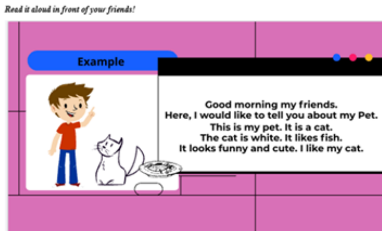
Figure 1. Pre-test Question

In this study, the pre-test was the first step in data collection. The pre-test was used as a brain warm-up to assess students' initial skills before receiving treatment. In this step, the researchers used the following instructions: