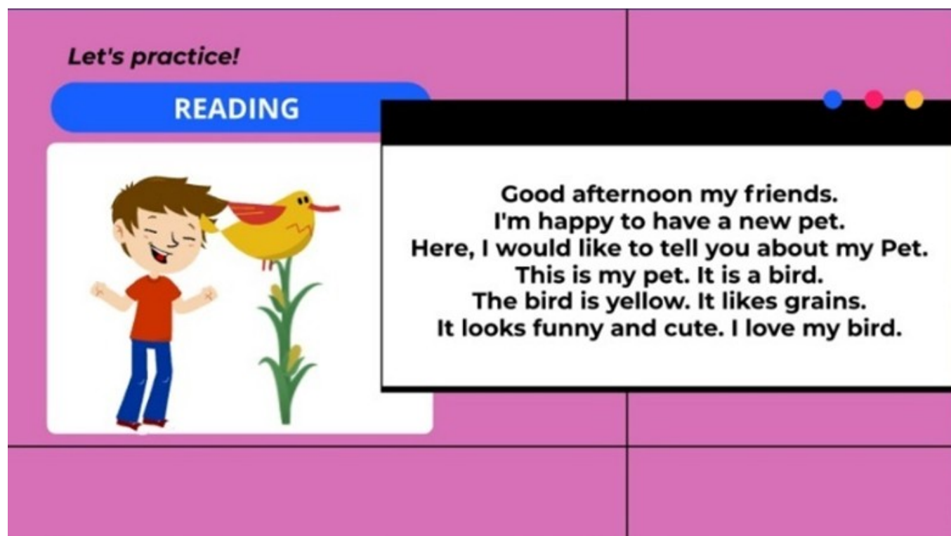
Figure 3. Post-test Question