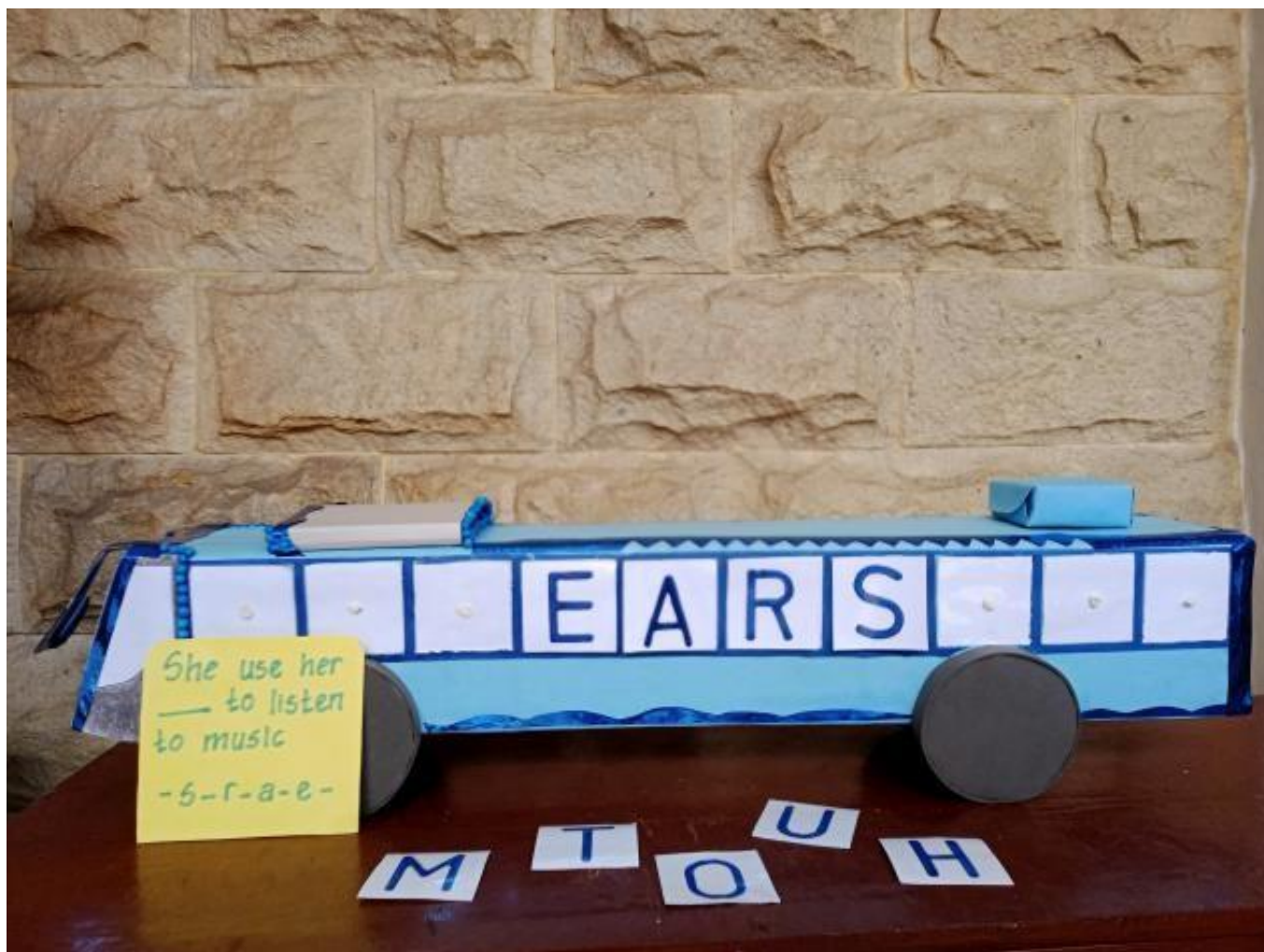
Figure7. View the Example of the question with the right answer