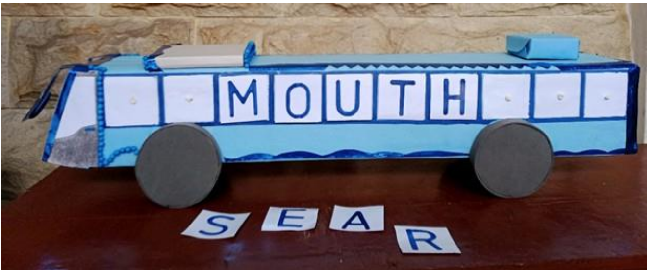
Figure3. Left Side View