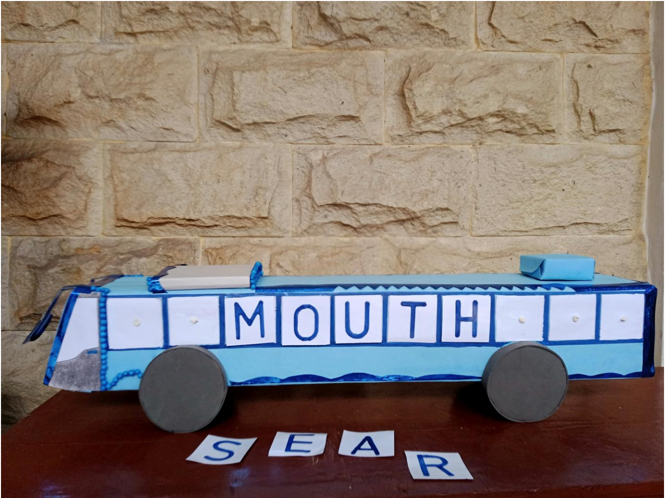
Figure 2. View words in correct order