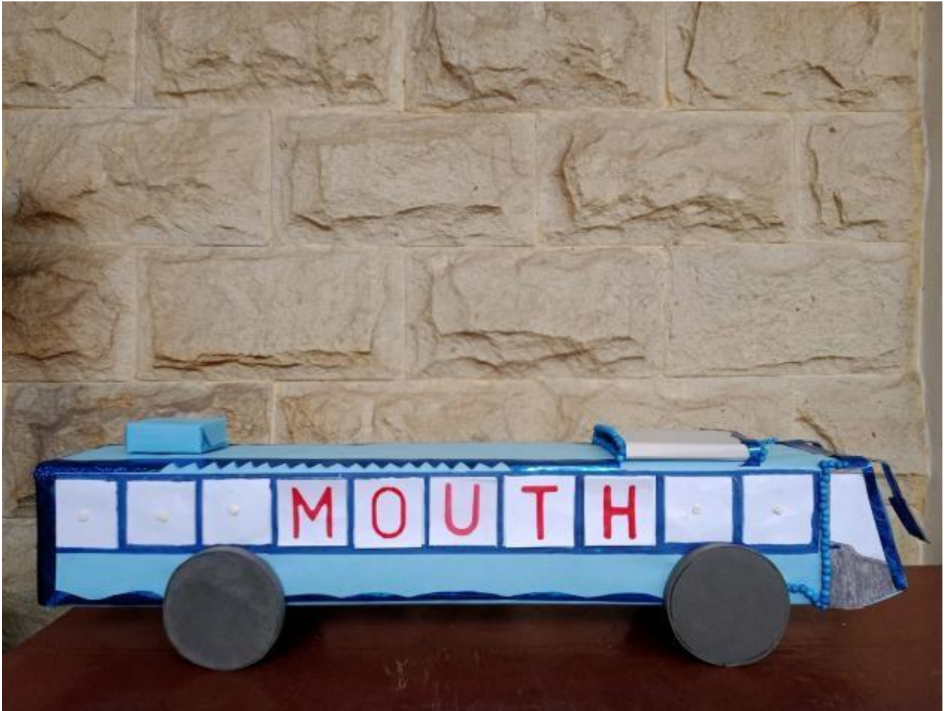
Figure 4. Right Side View